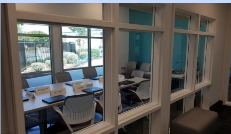
Paradise Admin Office