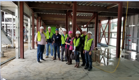
COC at Britton