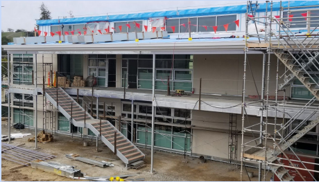
Britton Middle School