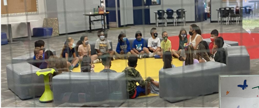
Restorative Justice Circle