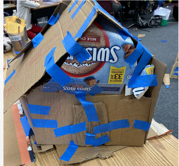
Catching a Gingerbread Man