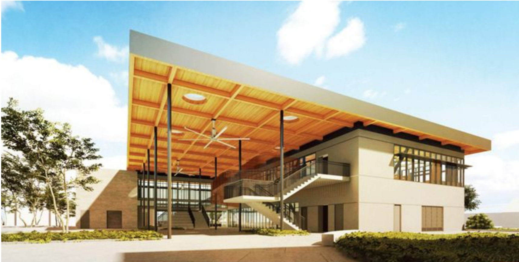
BRITTON MIDDLE SCHOOL MORGAN HILL UNIFIED SCHOOL DISTRICT