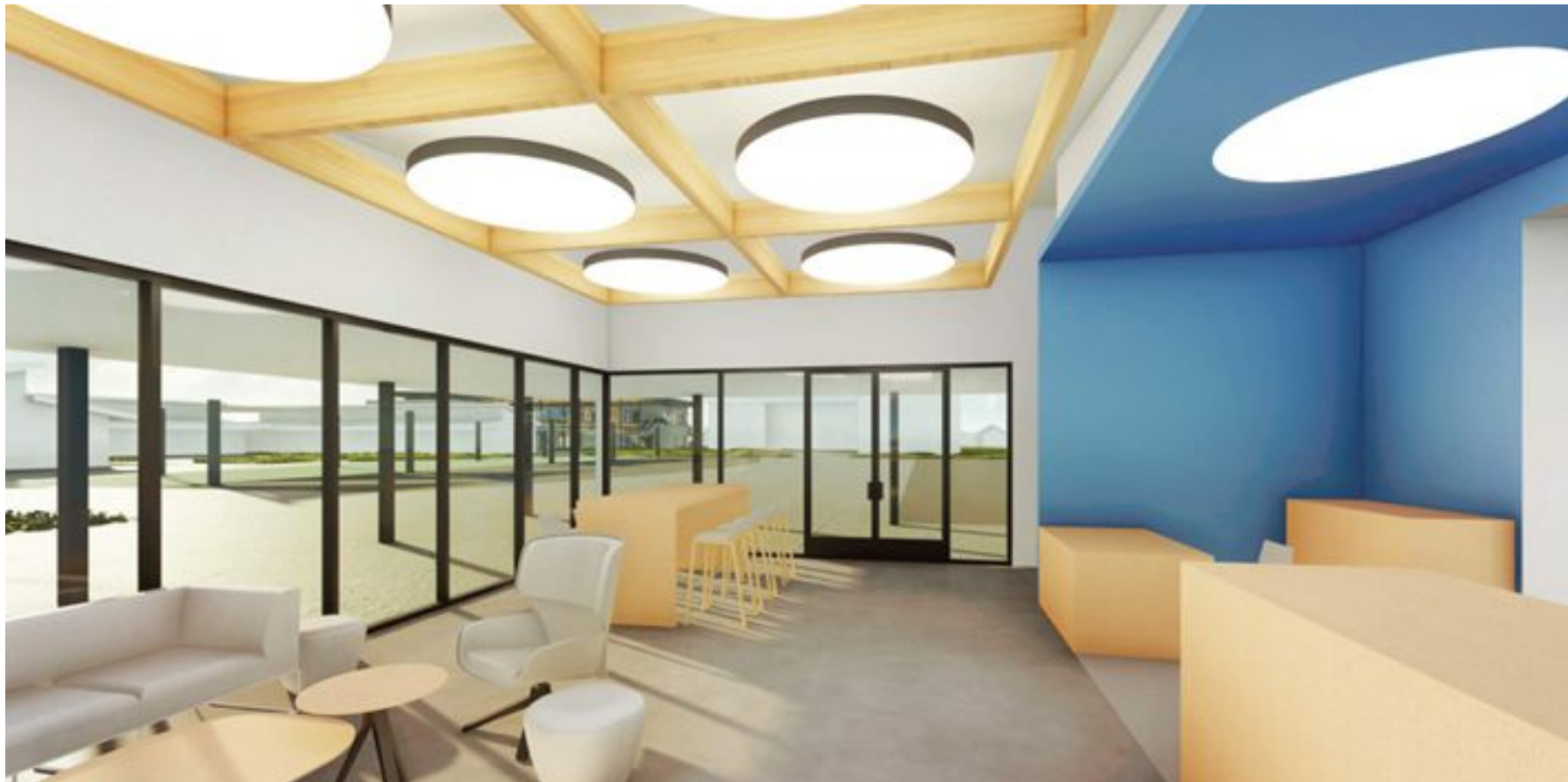
BRITTON MIDDLE SCHOOL MORGAN HILL UNIFIED SCHOOL DISTRICT