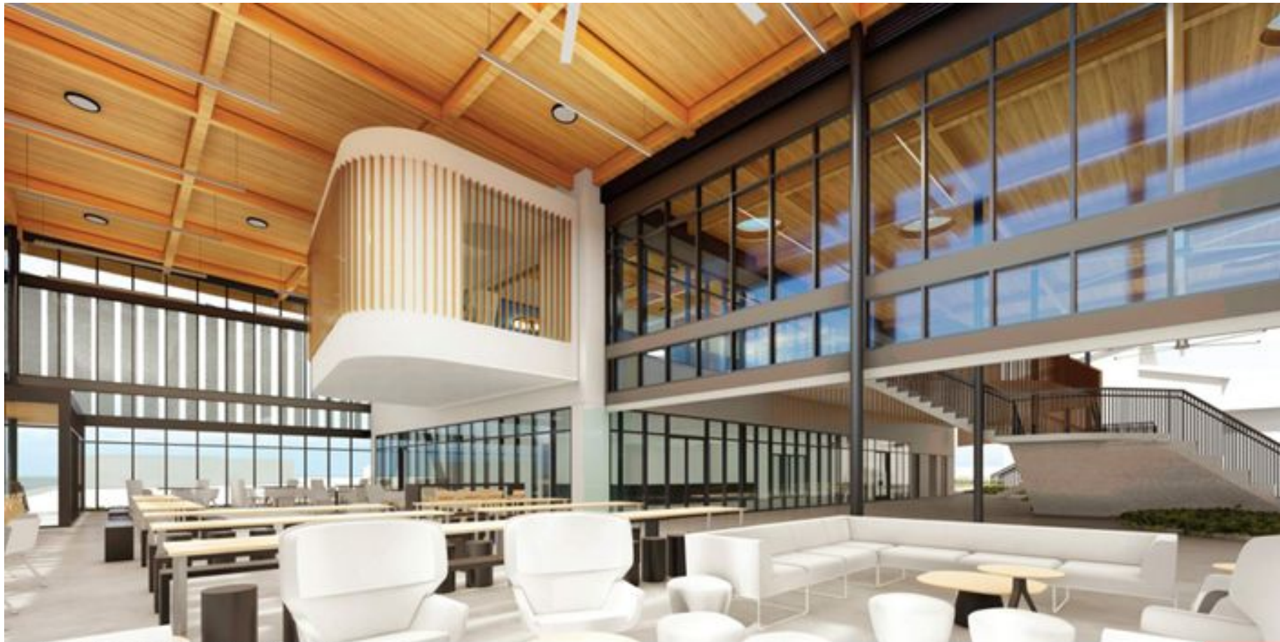
BRITTON MIDDLE SCHOOL MORGAN HILL UNIFIED SCHOOL DISTRICT

student union cafe rendering | copper slats study pod option