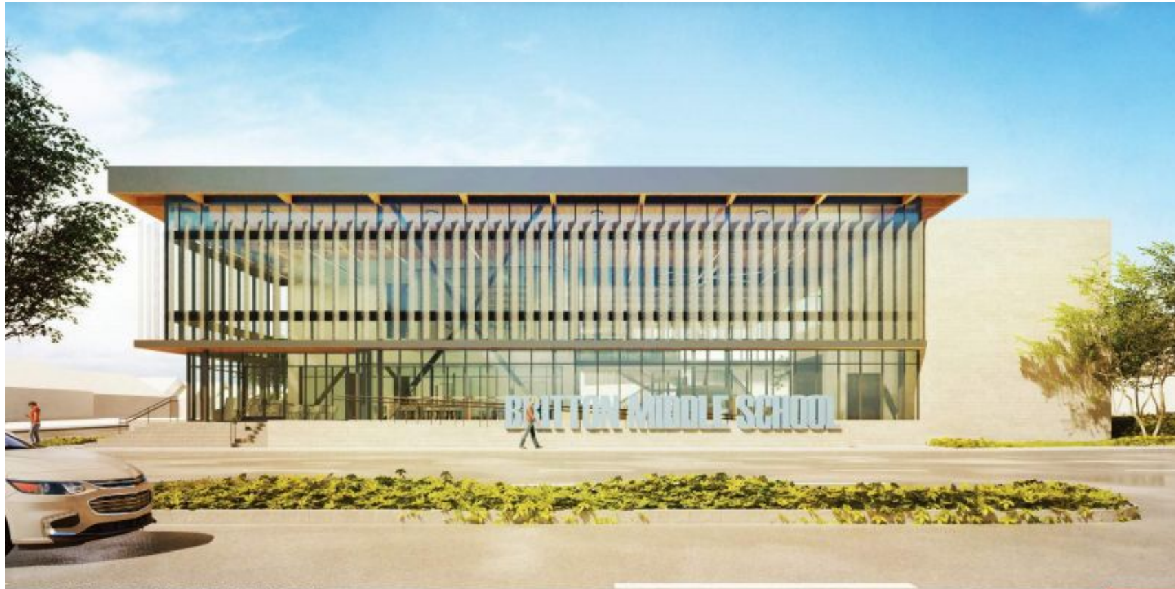
BRITTON MIDDLE SCHOOL MORGAN HILL UNIFIED SCHOOL DISTRICT